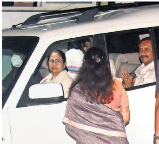
Mamata Banerjee leaves after meeting MK Stalin at his residence, on Wednesday in Chennai