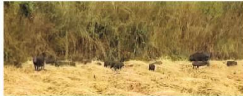
A drove of pigs spotted trespassing a farmland | EXPRESS

At Mansur, Mangundi, Navalur and other rural parts surrounding the city, the standing crops and the harvested crop are being targeted by these