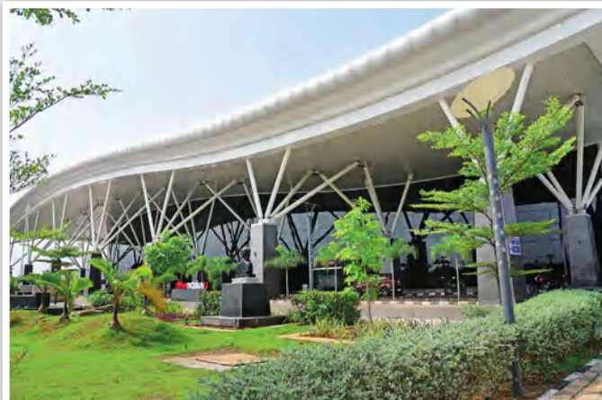
SIR MV TERMINAL | BENGALURU

Share your view on f @ in using #TheTimesofaBetterIndia