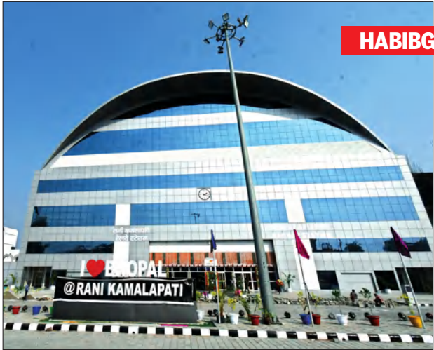
HABIBGANJ | MP