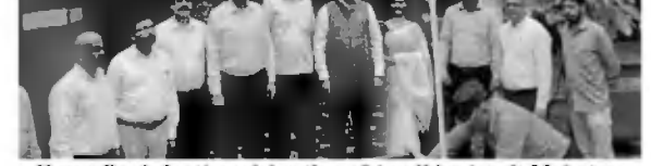
Harcro Bank for the celebration of Azadi Ka Amrit Mahotsav