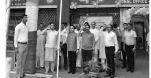
The 76th Independence Day of the country was celebrated with great pomp by the Chandigarh Circle and Divisional Office of Punjab National Bank.