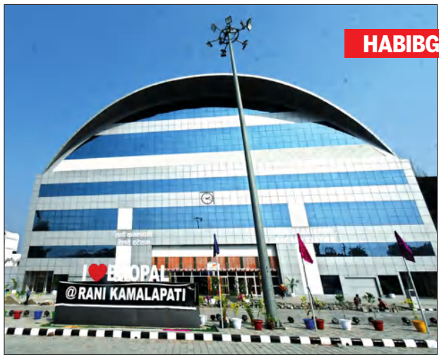
HABIBGANJ | MP