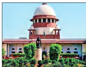
'Must examine declaration was not made under tutoring or duress'

said this is with the condition that there is no circumstance giving rise to any suspicion about its truthfulness.