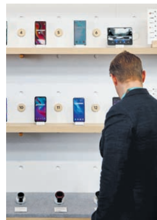
Google exhibit shows off a variety of devices with Google Assistant

Since then, the commission has widened its crackdown on digital giants with more antitrust investigations targeting Amazon, Apple and Facebook and sweeping new rules aimed at clamping down on firms.