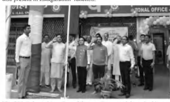
The 76th Independence Day of the country was celebrated with great pomp by the Chandigarh Circle and Divisional Office of Punjab National Bank.