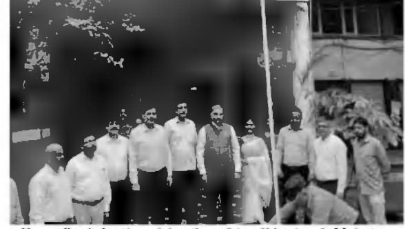
Harcro Bank for the celebration of Azadi ka Amrit Mahotsav