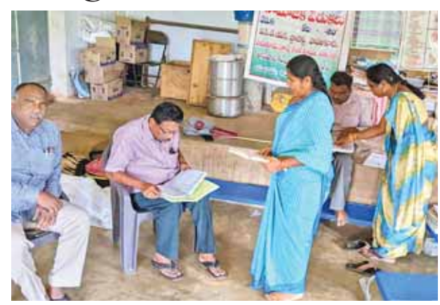
Vigilance and Enforcement officials inspecting the registers at an Anganwadi centre in NTR district on Friday