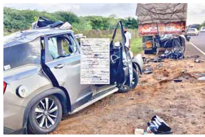
The mangled remains of the car that met with an accident on national highway