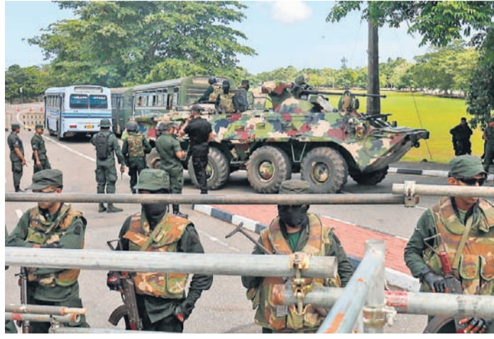
Sri Lanka soldiers stand guard near the parliament building in Colombo