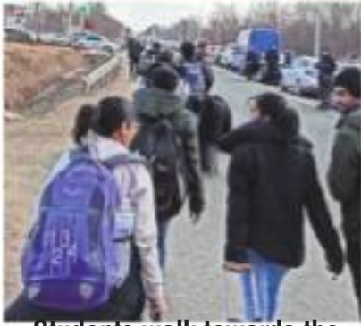
Students walk towards the border after getting down from bus 10 kms ahead