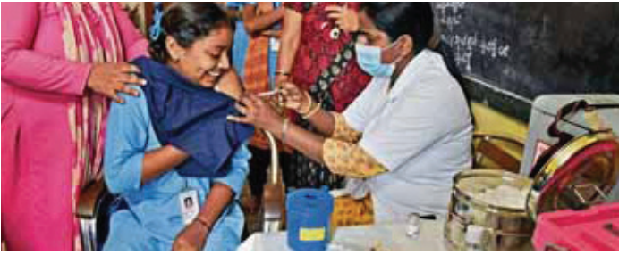
A health worker inoculates Covid-19 vaccine to class VIII student at govt school in Bengaluru on Tuesday

According to sources, at a meeting last week, TAC experts requested the state health department to send out a reminder to seek the status of the project report on the demand for animal surveillance. The TAC had in March sought the IAH&VB, Hebbal, to conduct a study and surveillance for Covid-19 in animals in zoos, national parks, game sanctuaries and others having close interaction with humans. "TAC recommends a health