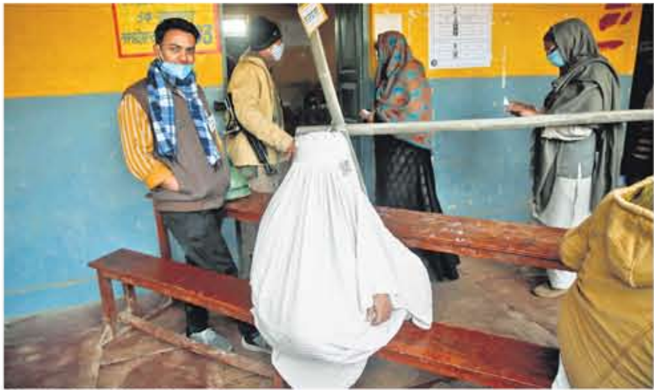
(From left) People waiting to press the button; Voters get their temperature checked as a precautionary Covid-19 measure at the entrance of a polling station; a citizen gets her finger marked with indelible ink after casting her vote | SHEKHAR YADAV