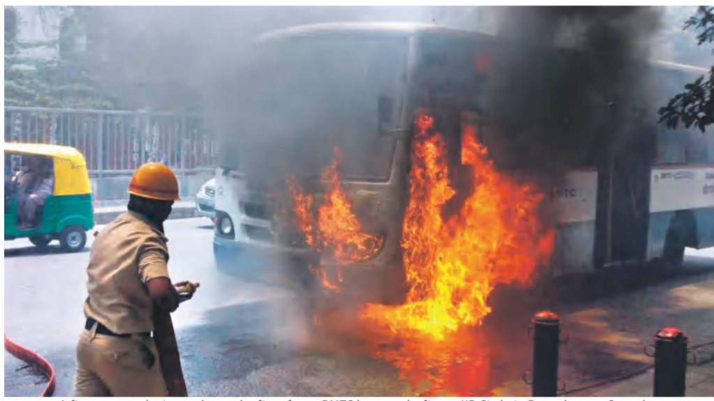
A fire personnel tries to douse the fire after a BMTC bus caught fire at KR Circle in Bengaluru on Saturday. All 35 passengers aboard the bus escaped unhurt

More than 800 private hospitals in Karnataka, including 100 in Bengaluru, have geared up to administer booster doses to those above the age of 18 from Sunday.