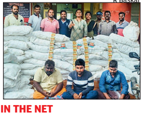
IN THE NET