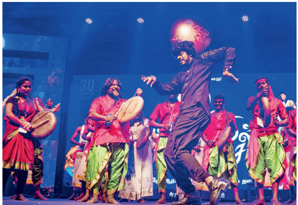
A DIFFERENT BEAT: Scenes from last year's Margazhiyil Makkalisai