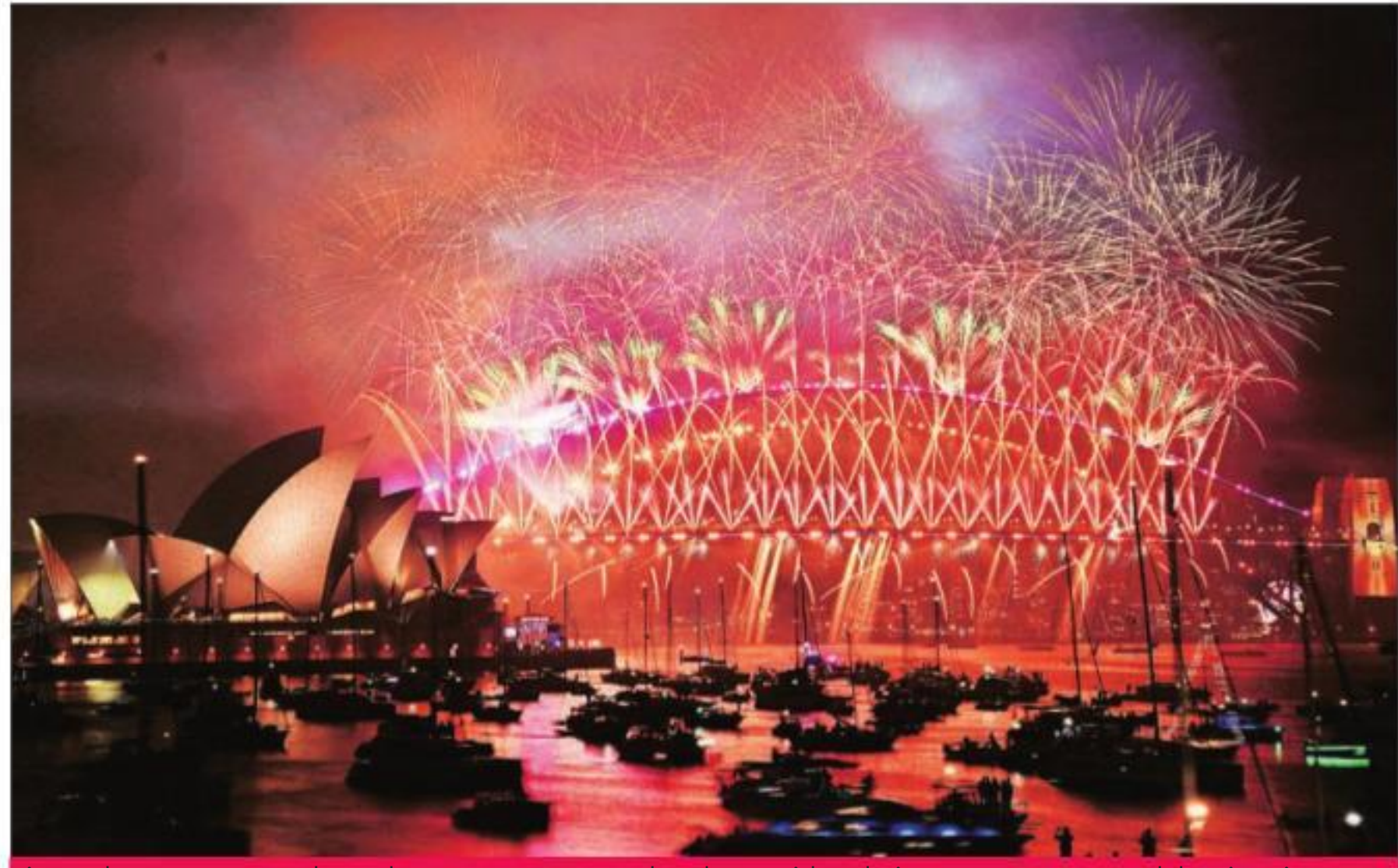
Fireworks are seen over the Sydney Opera House and Harbour Bridge during New Year's Eve celebrations in Sydney, on Sunday.