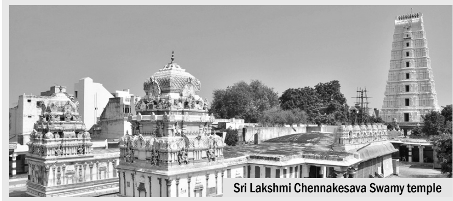
Sri Lakshmi Chennakesava Swamy temple

only two times since its inception. After the YSR Congress Party was established, the locals supported its candidates and elected them as MLAs in 2014 and 2019.