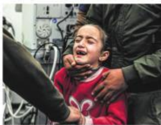
A girl mourns the death of her relatives in Khan Younis, Gaza City on Sunday

tral Gaza, an Israeli airstrike killed at least 13 people and wounded dozens of others. The bodies were draped in white plastic and laid out in front of a hospital, where prayers were held before burial.