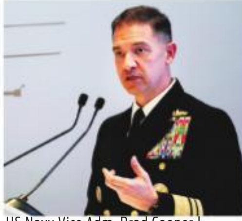
US Navy Vice Adm. Brad Cooper

"The US Navy helicopters returned fire in self-defence," sinking three of the four boats and killing the people on board while the fourth boat fled the