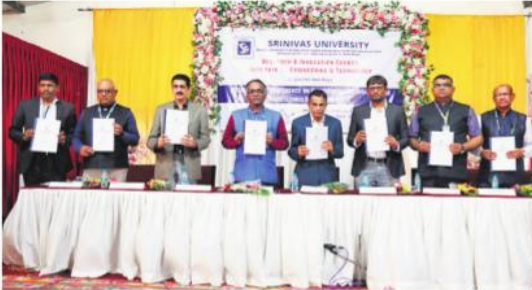
Dignitaries at an International Conference on Electronics, Mechanical, and Nanotechnology, ICEMN-2023, by Srinivas University in Mangaluru