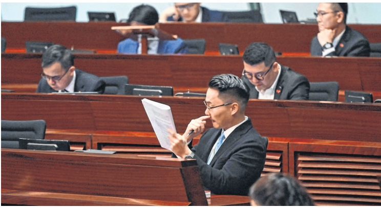
Members of the Legislative Council sit in the chamber during reading of the Article 23 security law in Hong Kong

China on Wednesday defended Hong Kong's draconian new national security law that grants the government more power to quash dissent and slammed the US, the UK and the EU for criticising it, saying they should stop interfering in its internal affairs and give up the illusion of continuing its 'colonial influence' in the southern Chinese city.