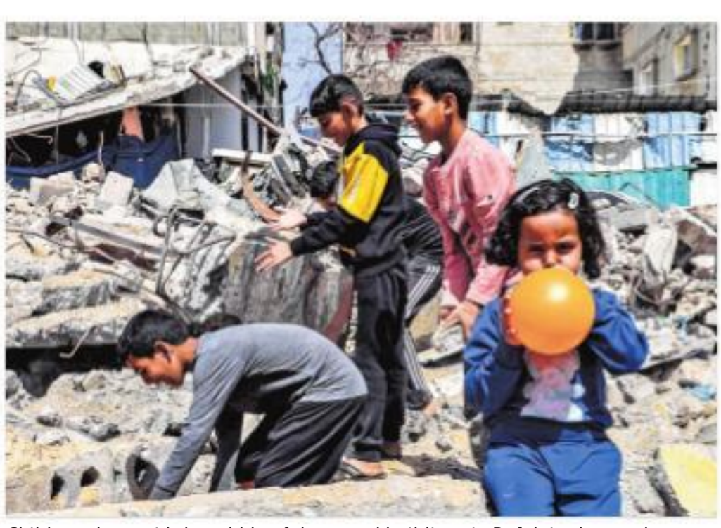
Children play amid the rubble of destroyed buildings in Rafah in the southern Gaza Strip on Friday

The two brigade officers who ordered the drone strikes, a